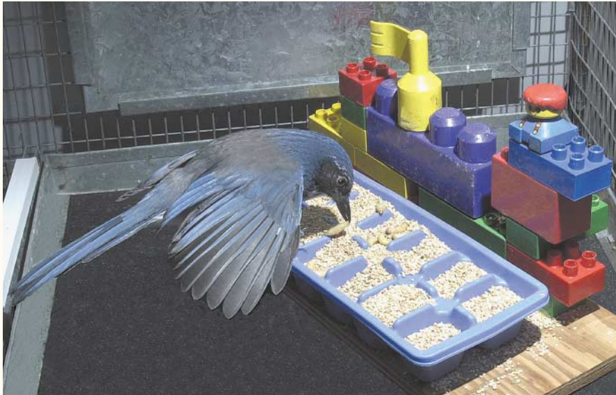
Figure 2 | A western scrub-jay caching wax worms. Birds hide the food items in trial-unique, visuo-spatially distinct caching trays filled with sand in which they can bury caches.

the information is encoded in a representational form that does not specify how this information is to be used in controlling behaviour. So an episodic memory should be able to interact with general knowledge (semantic-like memory) even if this information were gained after the episode had been encoded. Consider the case of the jay caching perishable food. If the jay establishes some wax-worm caches, and then subsequently discovers that worms generally degrade more quickly than originally thought, the bird should be able to update its knowledge about the rate of perishability and change its search behaviour accordingly, even though the episodic information about the worm caches was encoded before the acquisition of the new semantic-like knowledge about their decay rates. We found that the jays could do this — if they cached perishable and non-perishable items in different locations in one tray, and then subsequently discovered that worms from another tray had degraded more quickly than they expected, then when given the original tray back the birds switched their search preference in favour of the nuts. The birds continued to search for the perishable food if it had been cached recently. To our knowledge, this is the only demonstration of declarative flexibility in which animals can update their information after the time of encoding 52 .